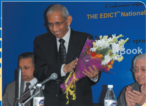
Hon'ble Justice R.C. Lahoti Former Chief Justice of India being felicitated