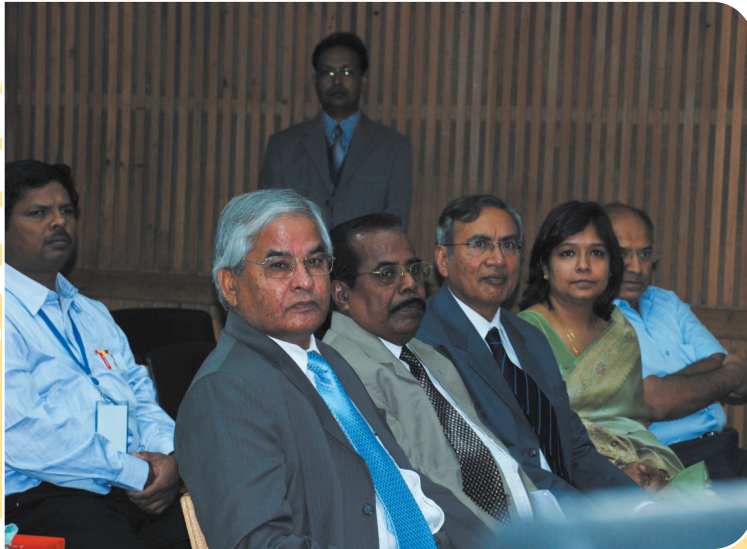
Audience in rapt attention