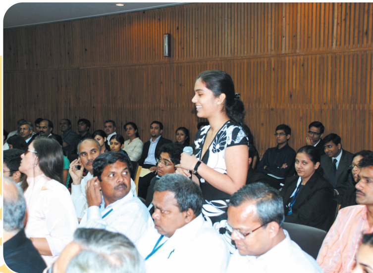
A student asking questions